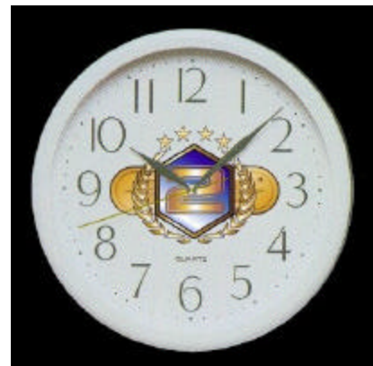
Region 2 Clock

Other Items # on hand Price Region 2 logo Clock 2 $25.00 Starfleet Buttons 5 $1.00 ODO keychains 9 $.25 Enterprise Air Freshners 19 $.50 CD's "A Very Strange Trip" 5 $1.00